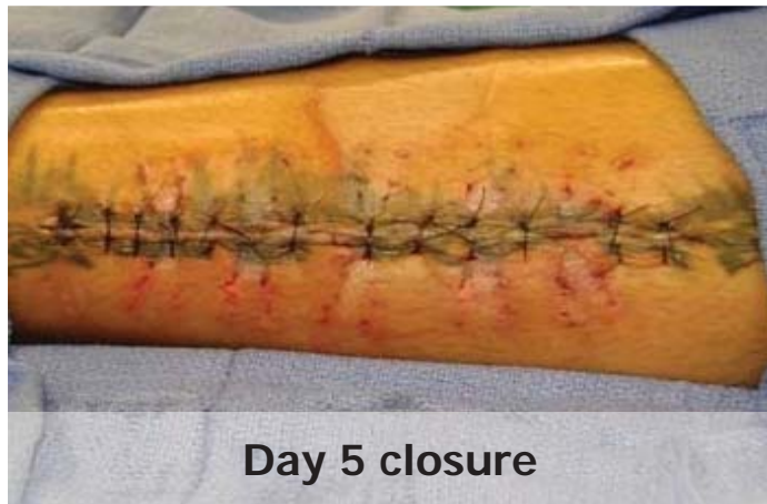
Day 5 closure

On Day 5 the margins were approximated and the wound was ready for closure.