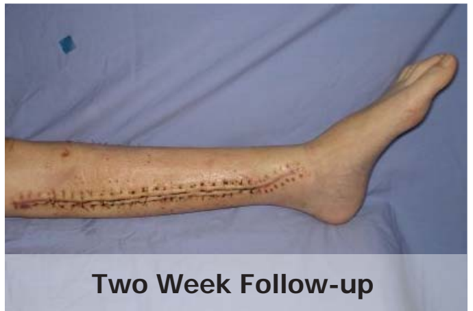
Two Week Follow-up

DERMA Close ® RC Continuous External Tissue Expander