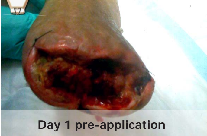
Day 1 pre-application