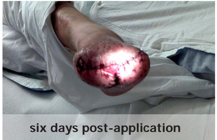
six days post-application

The DermaClose was applied in a shoelace configuration. Due to concern of intact tissue damage caused by the tension line the physician decided to periodically alternate to radial application.