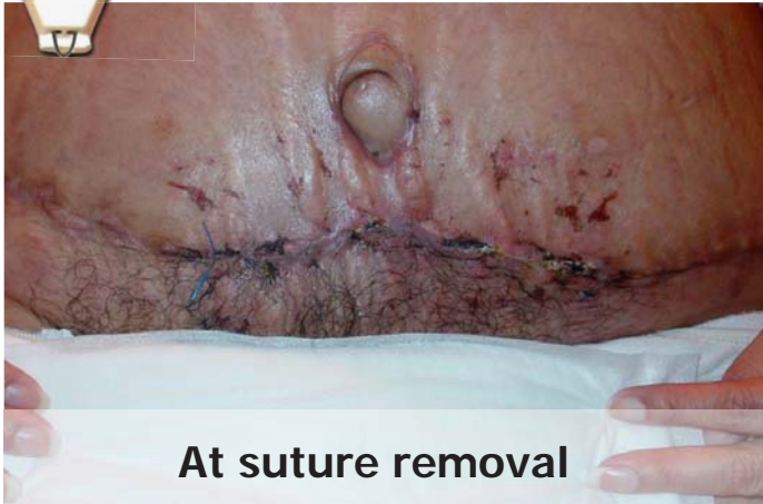
At suture removal

At 14 days the patient returned for suture removal.