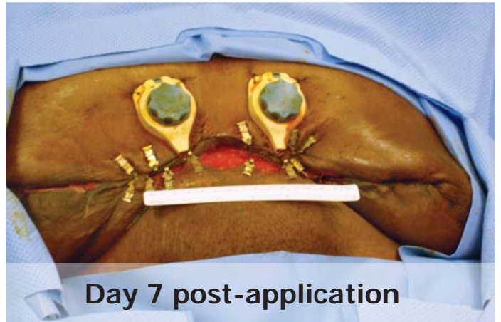
Day 7 post-application

DERMA Close ® RC Continuous External Tissue Expander