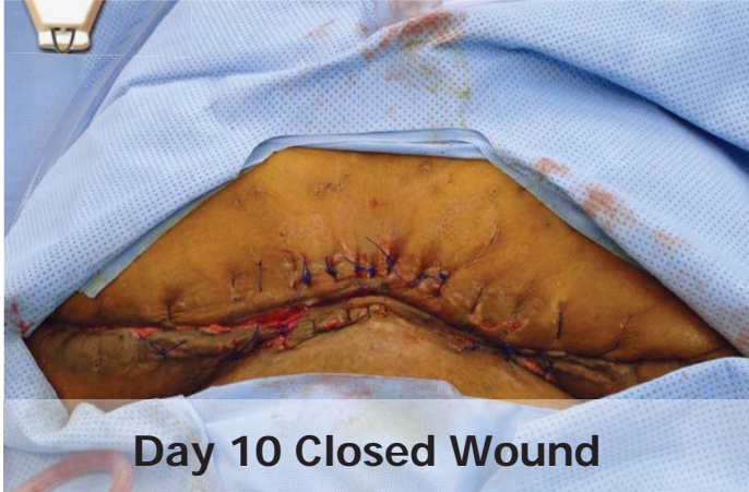
Day 10 Closed Wound