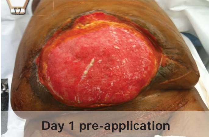
Day 1 pre-application