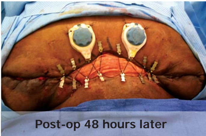
Post-op 48 hours later

This patient had undergone unsuccessful hernia repair due to biologic graft failure. NPWT was utilized for two months to establish a granular wound bed.