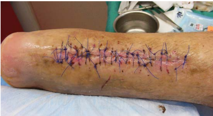
Day 11 – Well approximated wound edges sutures remain

S.B was brought to the operating room and sharp debridement was performed to resect 0.5 cm of the chronic wound margin. The wound bed was then debrided with a combination of hydrostatic pressure debridement with the Versa jet™ apparatus and sharp debridement with a scalpel to a healthy bleeding wound base without disrupting the underlying Achilles tendon. The surrounding wound margins were then mobilized by undermining approximately 0.5 cm. A skin-plasty was then performed at the distal and proximal wound margins in order to facilitate approximation of the distal and proximal skin edges (Figure 2). Copious irrigation was conducted utilizing 6 liters of normal saline mixed with polymyxin and Bacitracin. Two sets of deep wound cultures were taken following irrigation of the site; these were reported as no growth postoperatively. The DermaClose™ RC device was then applied to the wound site in a shoelace pattern to facilitate wound margin approximation. The skin edges were fully approximated within 5 minutes of tensioning of the DermaClose™ RC device. The device was left in place for 24 hours, the wound was inspected and the edges were coapted with out tension. The wound was further sutured closed and the device removed. The extremity was casted in a below knee gravity equines cast.