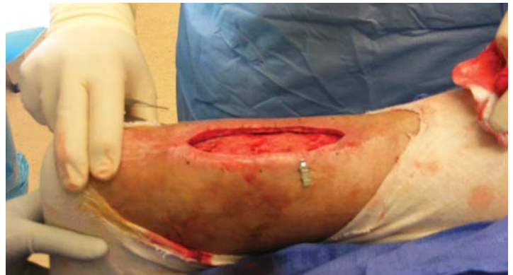
Day 1 – Wound presentation post debridement and application of tissue expander